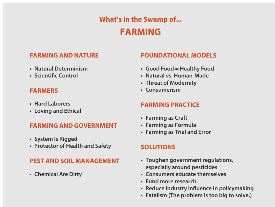
Figure 2: The Swamp of Farming

Taken together, the cultural models presented above comprise the “swamp” of public thinking about farming. This swamp depicts the implicit understandings and assumptions that become active when people think about this topic.