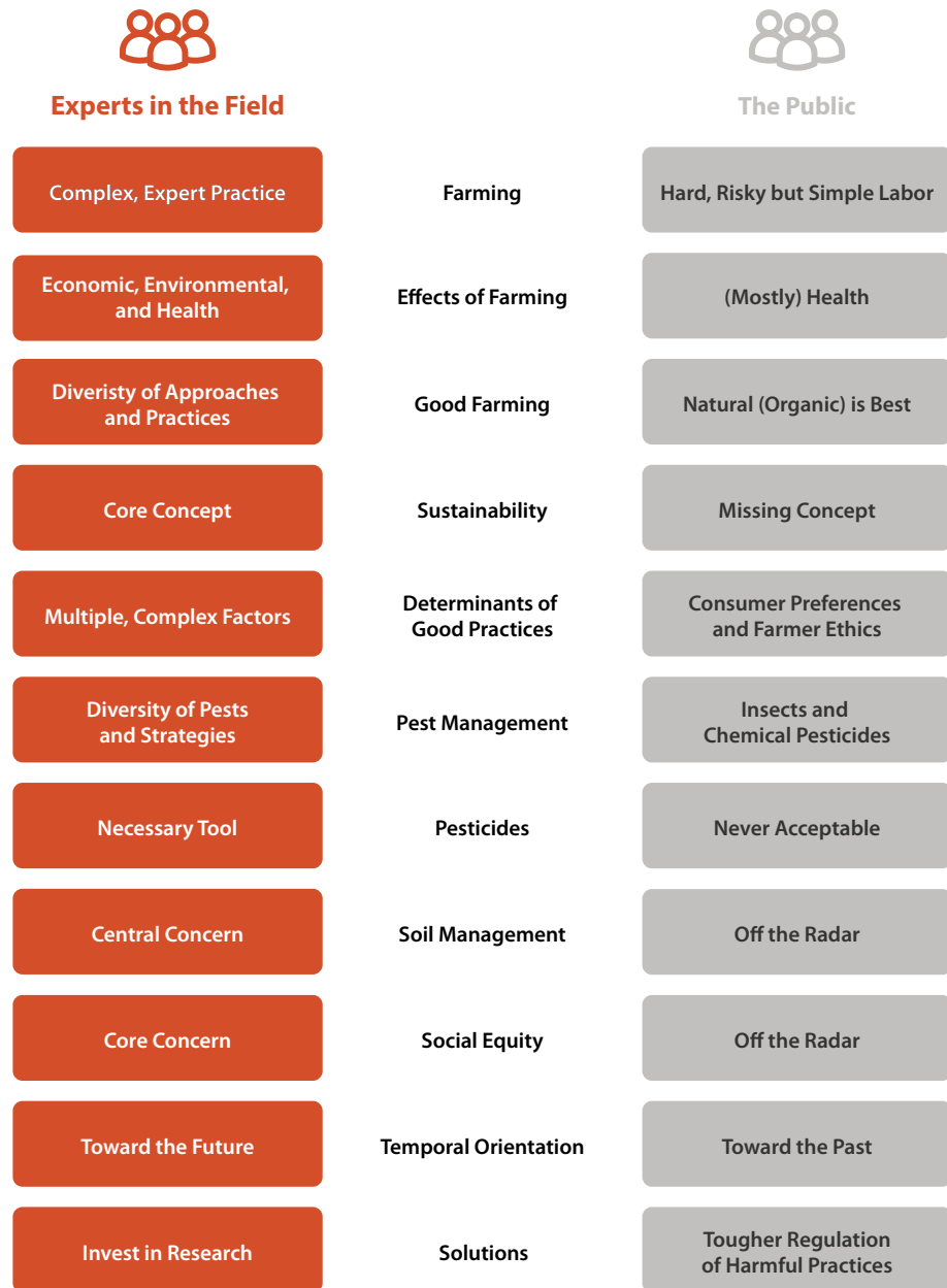
Figure 3: Mapping the Gaps

This graphic depicts the primary gaps between how experts and the public think about farming: